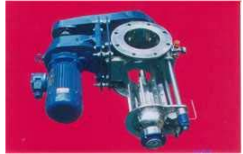
Quick Release Rotor (Sanitary construction)

DROP THROUGH TYPE: Available in both cast and fabricated constructions. These are essentially used for free flowing materials. Depending on the flowability, the vane pockets can be full depth, shallow depth or scalloped. Open or shrouded rotors are also available. Further, Scorpio has developed a sanitary Rotary Airlock with a new mechanism whereby the valve can be cleaned more easily and more quickly. In this quick removal type model, the rotor and end covers can be completely removed for cleaning and slide back easily into position with perfect alignment.